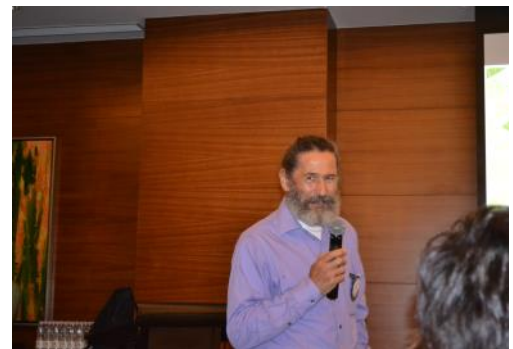
Urban-Rural Bridge speakers