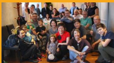
Family Sunday Brunch