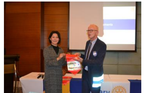
Banners and recognition presentation